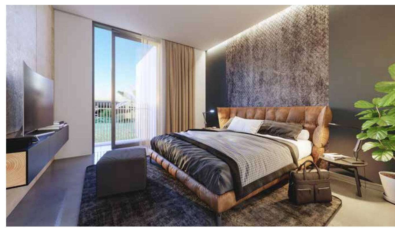
The depictions herein are for illustration purposes only and subject to change without prior notice.