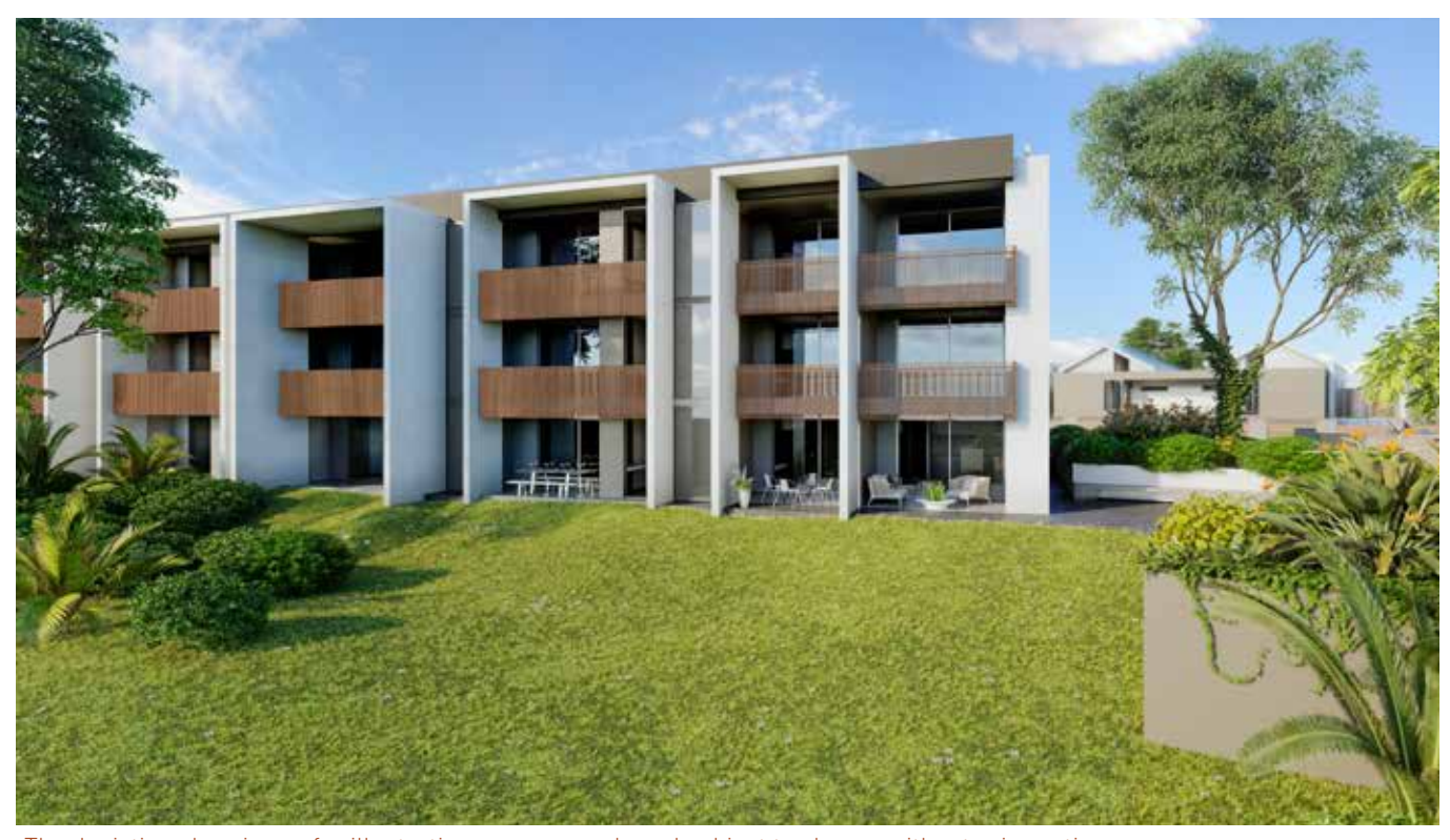
The depictions herein are for illustration purposes only and subject to change without prior notice.