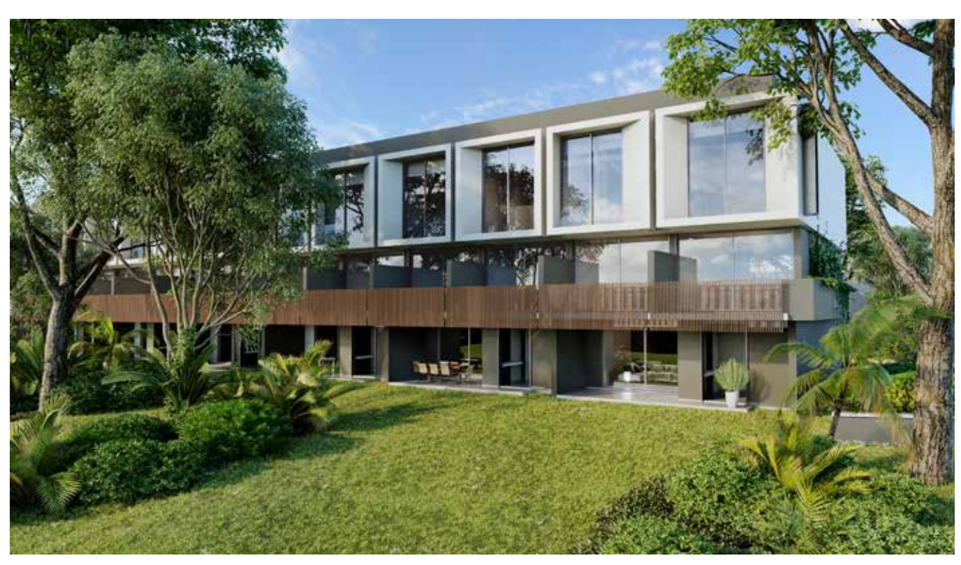
The depictions herein are for illustration purposes only and subject to change without prior notice.