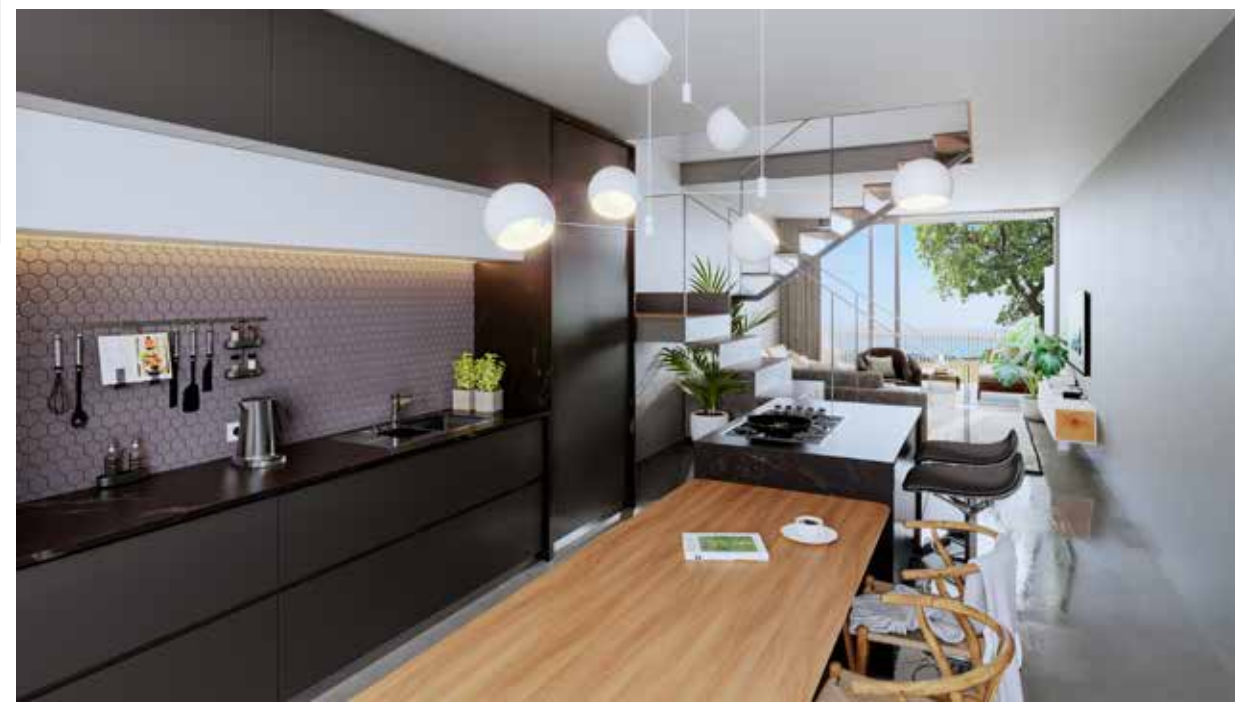
The depictions herein are for illustration purposes only and subject to change without prior notice.