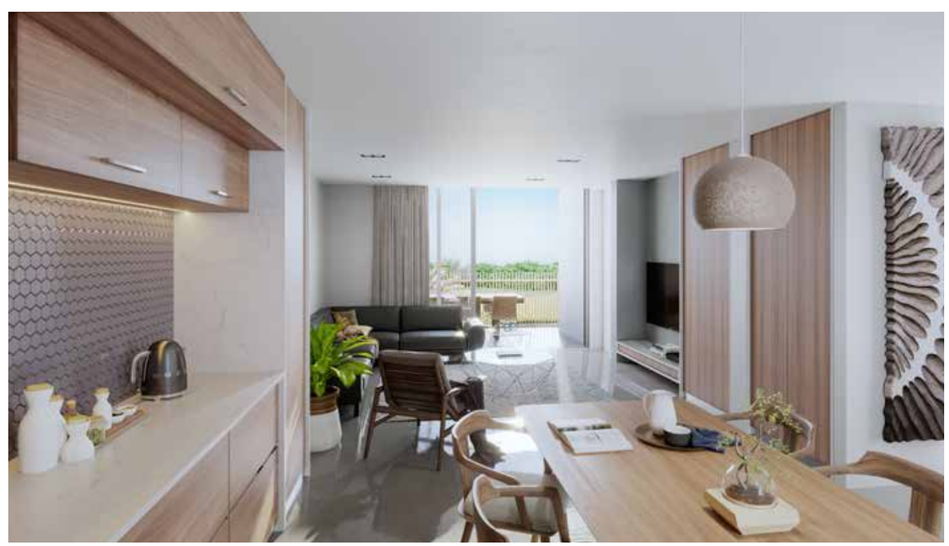
The depictions herein are for illustration purposes only and subject to change without prior notice.